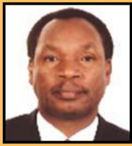
Hon. Henry Kosgey.