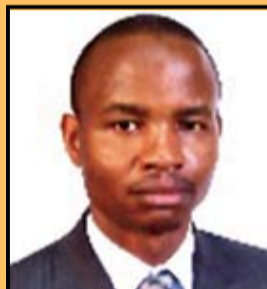
Hon. Charles Kilonzo.