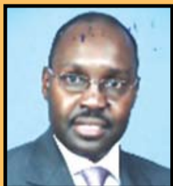
Hon. Sammy Koech.